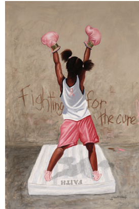
"PINK POWER" FIGHTING FOR THE CURE CERAMIC TILES 23-5-WRITING-PINK 4" x 4" ceramic tile (set of 2)