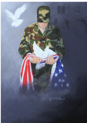
A PRAYER FOR PEACE CERAMIC TILES 23-5-PRAYERFORPEACE 4" x 4" ceramic tile (set of 2)