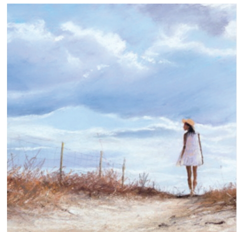
TRANQUIL PASSAGE II CERAMIC TILES 23-5-TRANQUIL-PASS 4" x 4" ceramic tile (set of 2)