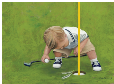
WHERE'S THE BIRDIE 3 CERAMIC TILES 23-5-WHERESBIRDIE3 4" x 4" ceramic tile (set of 2)