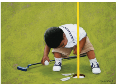
WHERE'S THE BIRDIE CERAMIC TILES 23-5-WHERESBIRDIE 4" x 4" ceramic tile (set of 2)