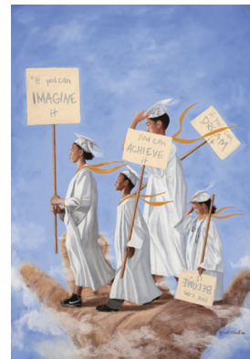
WHAT THE FUTURE HOLDS CERAMIC TILES 23-5-ENCOURAGECHILD 4" x 4" ceramic tile (set of 2)