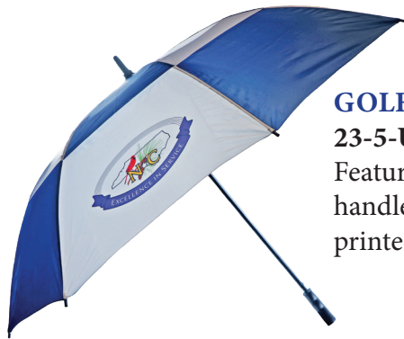
GOLF UMBRELLA 23-5-UMBRELLA-MA

Features a 64" nylon canopy with a fiberglass shaft and a rubber grip handle. Navy blue and white with Excellence In Service logo screen printed on the white panel.