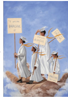
WHAT THE FUTURE HOLDS OPEN EDITION PRINT

23-30-PRAYERFORPEACE 14.75" x 21" (image size) 15.75" x 22" (paper size)