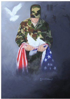
A PRAYER FOR PEACE ARTIST PROOF EDITION PRINT

23-30-WRITING-PINK 24" x 36" (image size) 25" x 37" (paper size)