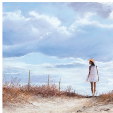
TRANQUIL PASSAGE II LIMITED EDITION PRINT

23-30-WHERESBIRDIE3 14" x 20" (image size) 15" x 21" (paper size)